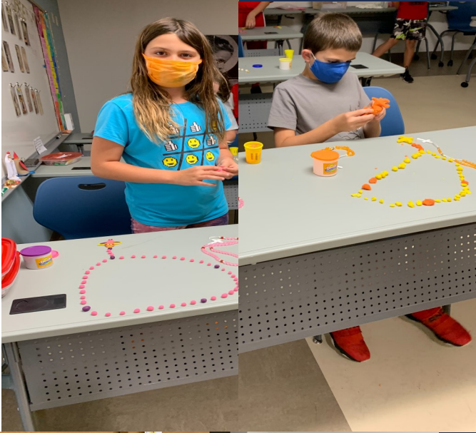
Rosary Makers In Training!